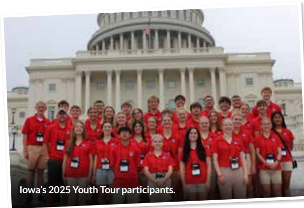
Iowa's 2025 Youth Tour participants.