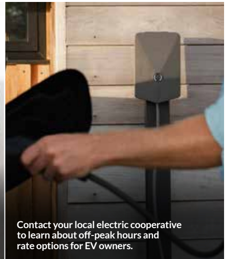
Contact your local electric cooperative to learn about off-peak hours and rate options for EV owners.