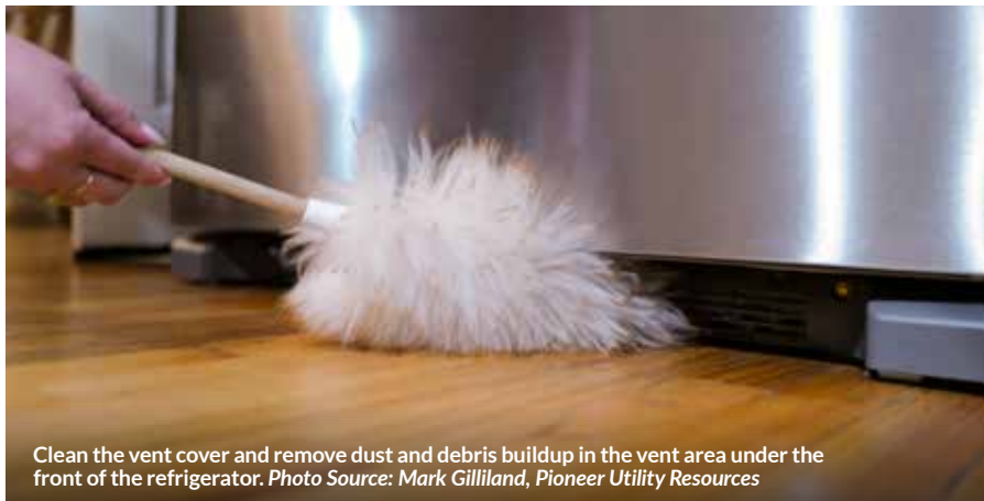
Clean the vent cover and remove dust and debris buildup in the vent area under the front of the refrigerator.

Keep it clean. Regularly cleaning the gasket – the flexible strip around the perimeter of the fridge door – ensures a tight seal between the door and the unit, keeping cold air inside. If the gasket is not sealing tightly, it should be replaced. Removing and cleaning the vent at the bottom of the