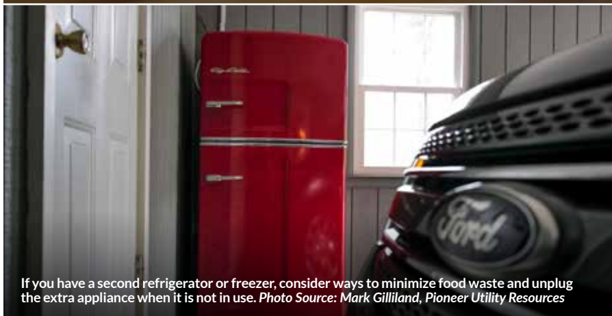
If you have a second refrigerator or freezer, consider ways to minimize food waste and unplug the extra appliance when it is not in use.

unit can help with airflow. For the coils at the back, use an extended cleaning brush instead of moving the fridge, which can cause injury.