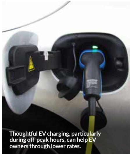
Thoughtful EV charging, particularly during off-peak hours, can help EV owners through lower rates.

Iowa's electric cooperatives play a vital role in managing energy demand and ensuring reliable service for all members. For co-op members who own EVs, off-peak charging provides a strategic solution to help reduce strain on the grid while also lowering costs, because charging when demand is lower eases pressure on the