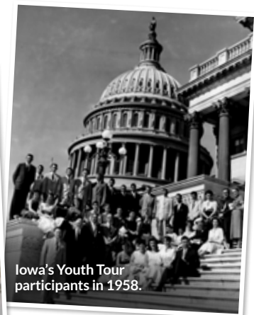
Iowa's Youth Tour participants in 1958.

Mall, the U.S. Capitol, the Marine Corps Sunset Parade and more museums than we can count.